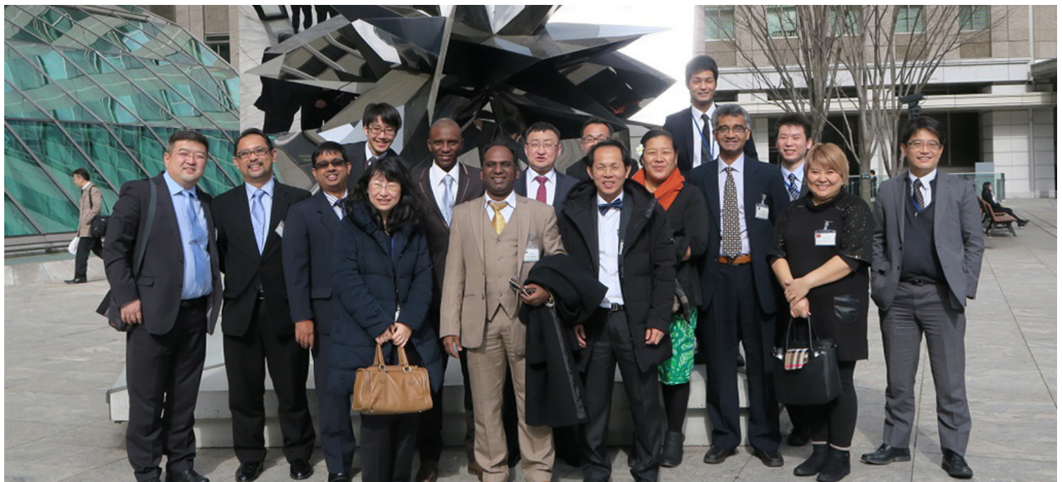
Delegates at the Japan Customs Headquarters at Kagumigesaki, Tokyo

opportunity networking with the current GRIPS batch 2016/2017 students. The experience sharing sessions would allow them to project what can be done 10 years ahead of time enabling them to visualise what they are and will be experiencing in future.