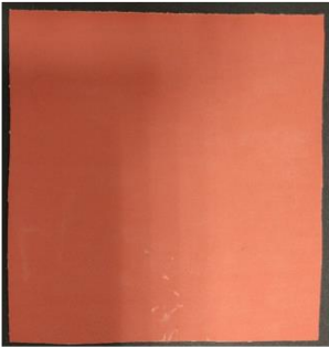
Face Side "Pinkish Red"