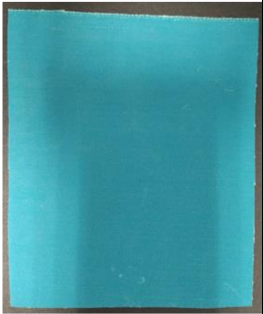
Bottom Side "Blue"