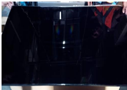
Front View –TV Panel:BN-00718A