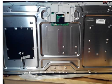
Rear View – TV Panel:BN-00718A