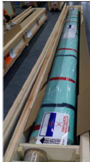
Packaging in Wooden Box