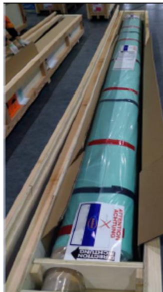
Packaging in Wooden Box