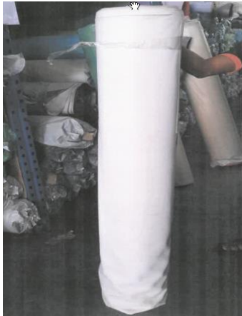
(a) Kepingan berwarna krim